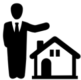
Onsite Office Assistant / Property Manager