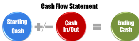
Cash Flow Report