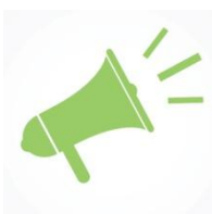
Exhibitions / Campaign