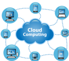
Cloud base software