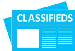
News Paper Advertising