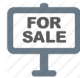
Listing on our Portal